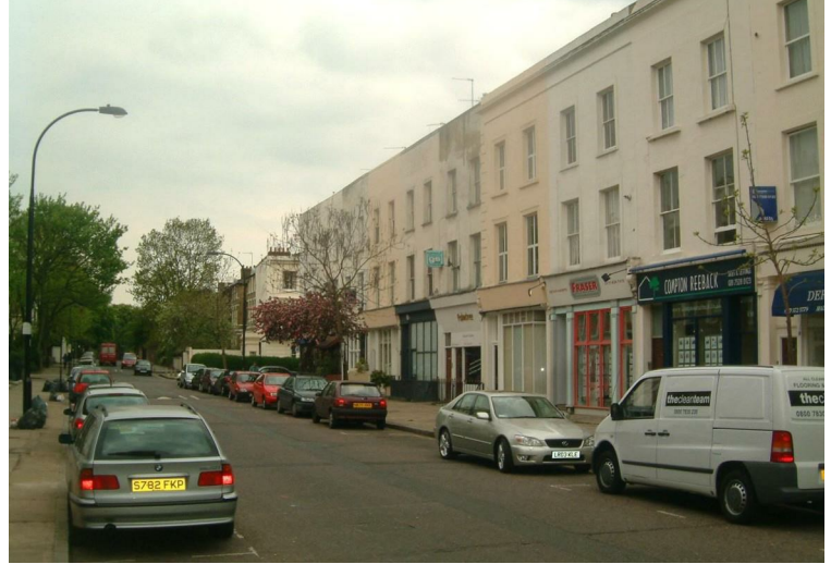
Boundary Road, St John's Wood, NW8 £13,750 Per Annum Subject to contract

An A2 Office TO LET in this popular location off Abbey Road.