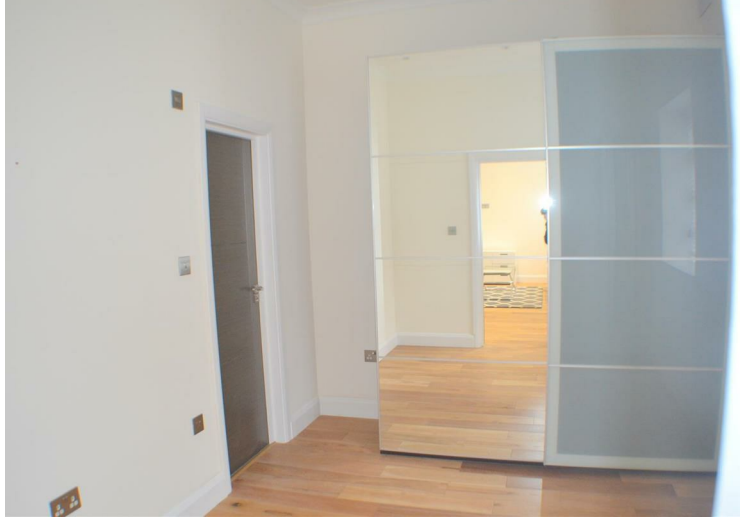
Double Bedroom In Hampstead! £403 Per Week Part furnished